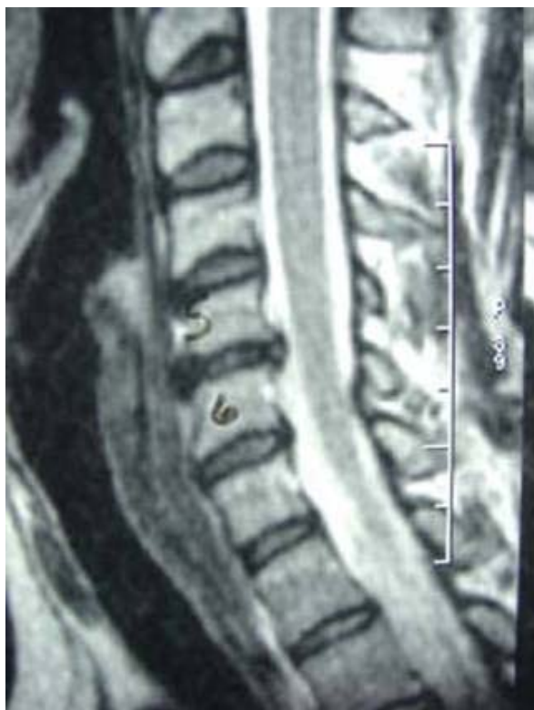
Figure 2 is the sagittal image showing the anterior and posterior C5-C6 disc herniation and the smaller C6-C7 disc herniation.