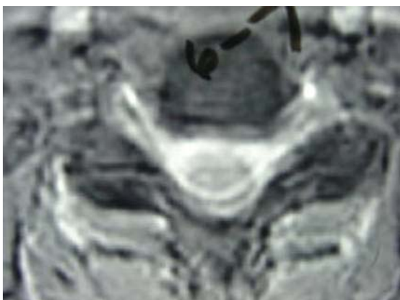
Figure 3 shows that the broad based C6-C7 disc herniation does not contact the spinal cord.

This 46-year-old white, married female school teacher was seen in March 2006 for the chief complaints of cervical, upper thoracic, and right arm pain extending to her hand. She has had this pain for fifteen years and has just completed a course of DRS treatment from September 05 through January 06 which gave approximately 70% relief. She has also tried acupuncture, traditional chiropractic manipulation, and finds that sleeping on her left side gives her relief. She now seeks our treatment with long y axis decompression manipulation of the cervical spine.